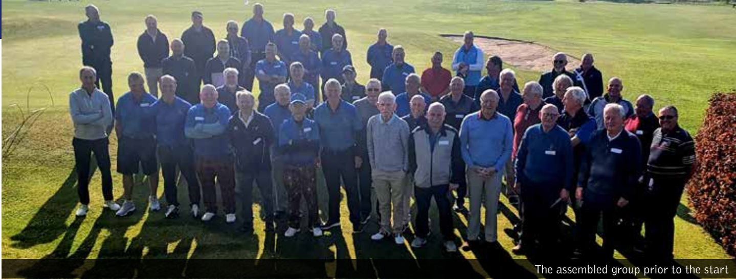
The assembled group prior to the start