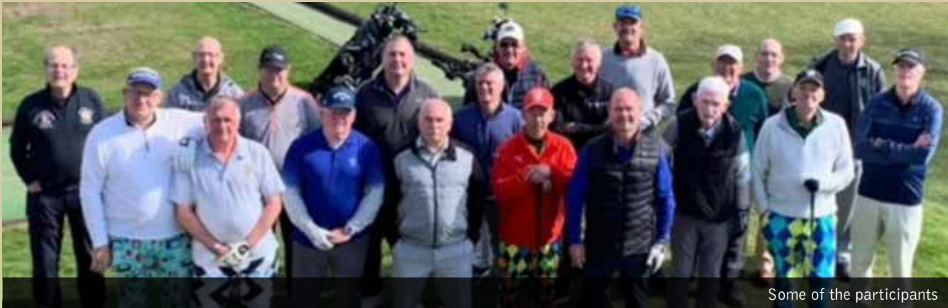
Some of the participants