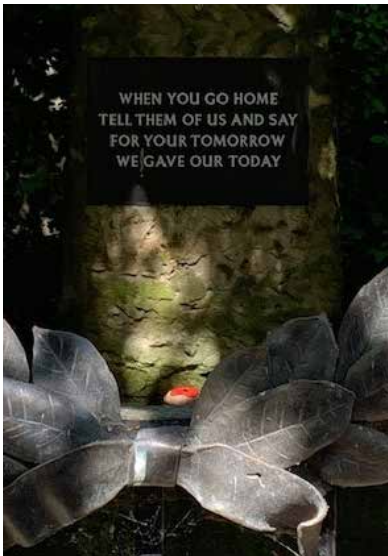
The Kohima Memorial at York Minster, displaying the Kohima Epitaph