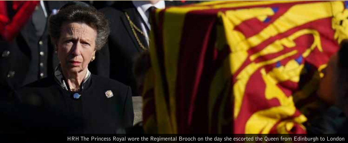
HRH The Princess Royal wore the Regimental Brooch on the day she escorted the Queen from Edinburgh to London