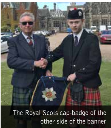
The Royal Scots cap-badge of the other side of the banner