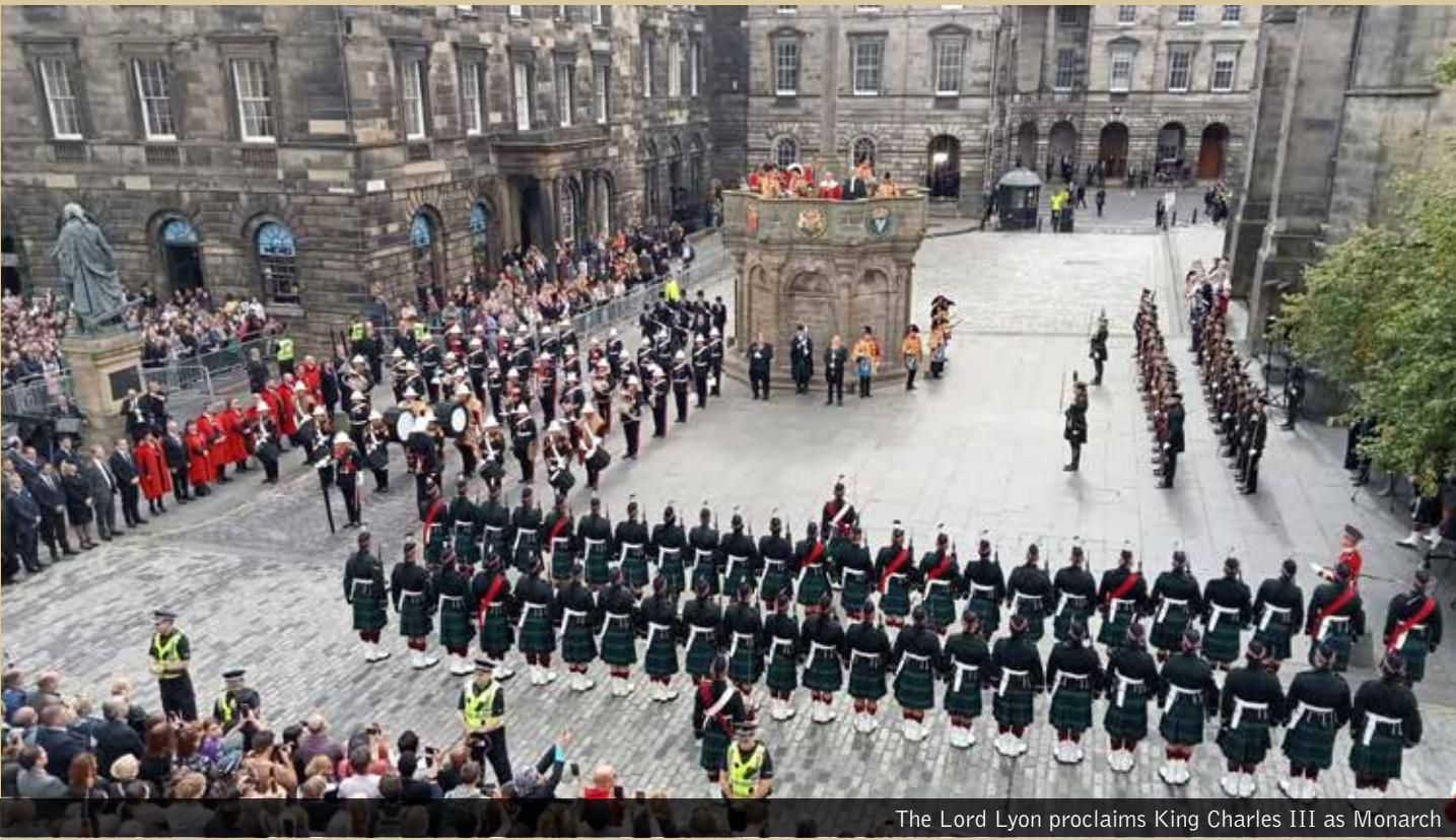
The Lord Lyon proclaims King Charles III as Monarch

A letter was sent to Buckingham Palace to convey our condolences to Her Royal Highness The Princess Royal: