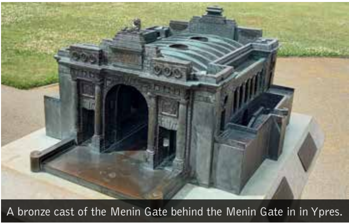
A bronze cast of the Menin Gate behind the Menin Gate in Ypres.

We departed Arras on 3 July to head back to Rotterdam via Ypres. The cloth-producing city of Ypres was almost destroyed during the Great War. Its sensitive reconstruction remains one of the wonders of modern Europe. In many places it’s hard to believe you’re not looking at a