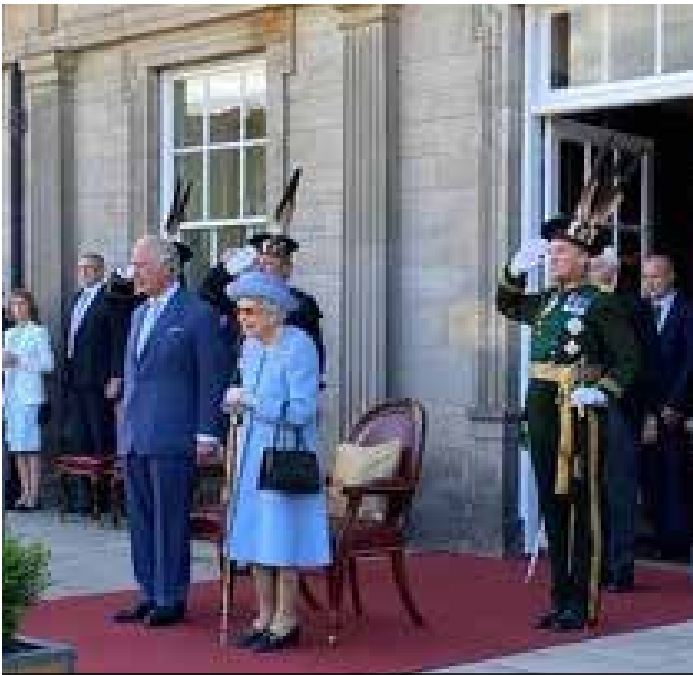
The Queen and Prince of Wales at the Palace of Holyrood House during the Archers parade