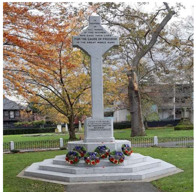
Wreaths have been laid and ceremony finished