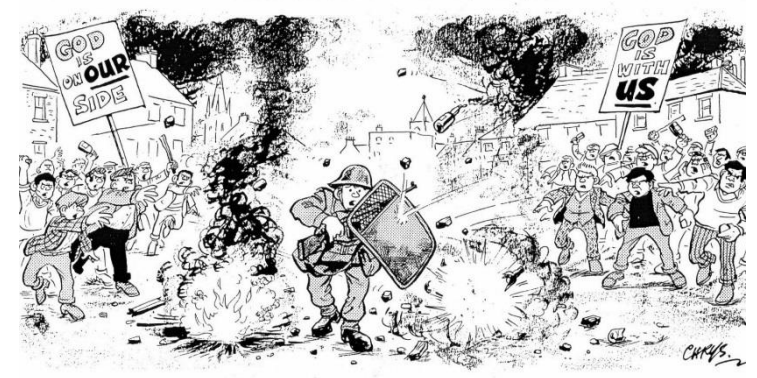
"I wish somebody was on MY