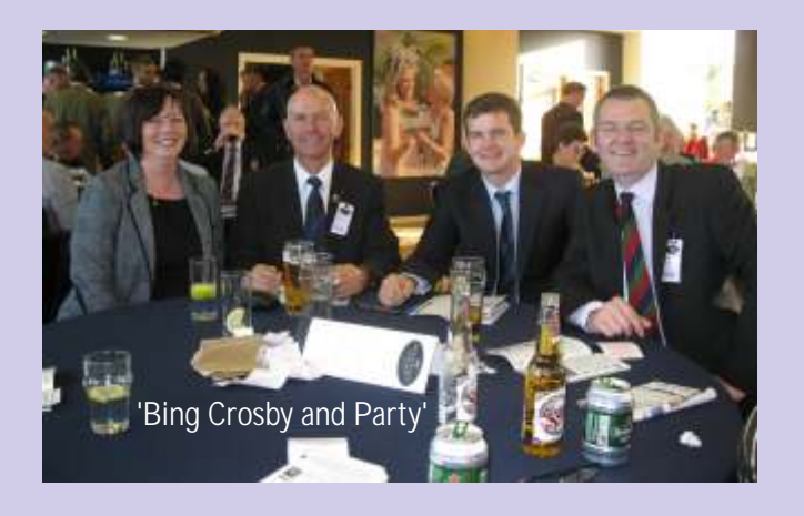
The sun shone and the winnings were bountiful, at least that's what we were told, even though there have to be

Musselburgh Racecourse continues to make us most welcome. Two examples from this year are that having been allocated two races, the RS Club Race and the RS Regimental Race, we were allocated two more on the day, one featuring The Royal Regiment of Scotland and the other being an additional RS Regimental Race. Thus we were accorded considerably more exposure than at first anticipated. The other example is that we were invited to use the Lothian Suite for all those attending as a focal point in which to gather.