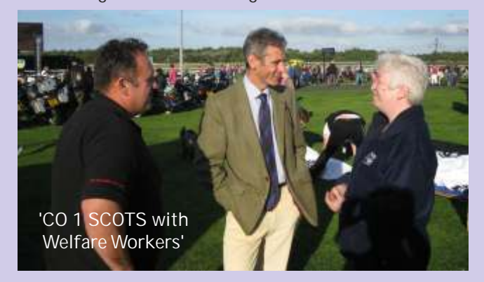
Be sure to make a note in your diaries for 2014 – Sunday 28 September!

losers in order to pay for the winners! Rather fewer tickets were sold to RS and SCOTS this year than last and those who didn't attend missed a first class day out. However, the overall number coming through the turnstiles was 500 up, so we must have enduring appeal. Although the Lothian & Borders ACF were not with us this time, we look forward to having their climbing wall and obstacle course in 2014. Our successors in 1 SCOTS provided a military equipment display and were augmented by stands from SSAFA Forces Help and ABF The Soldiers Charity both of whom do wonderful welfare work for our comrades. The RS Benevolent Society and RS Club both featured in the programme, each with full page articles. RBLS joined us for the second time and the RBLS Riders Branch provided centre stage attraction throughout the afternoon.