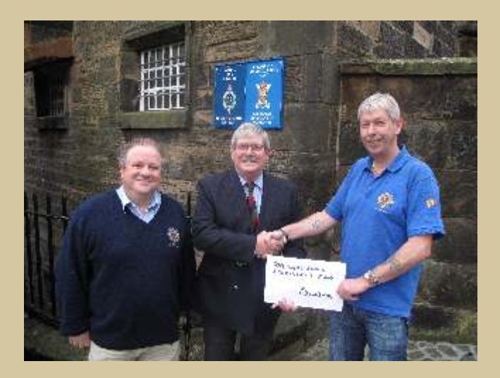
'The Easy bit of the Job"

Fundraising seems to have become a major Regimental pastime and one for which the recipients, the Benevolent Society and the Museum Lighting Appeal, are extremely grateful.