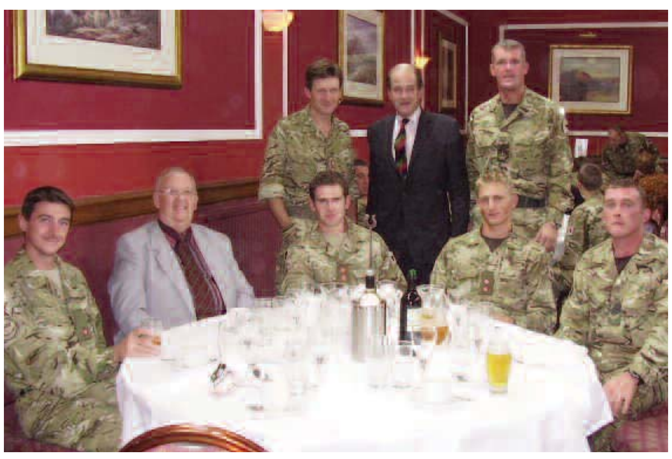
1 SCOTS Homecoming Lunch at The Royal Scots Club

The Club has been typically active over the summer and autumn with a number of very successful events including Sunday Lunch and Beating Retreat by the Association Pipe Band. Having welcomed B Company 1 SCOTS back from Afghanistan last May, we also hosted a party of 70 all ranks to lunch in the Hepburn Suite on 13th October amid their programme of Homecoming Parades.