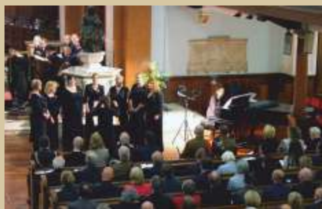
Military Wives Choir