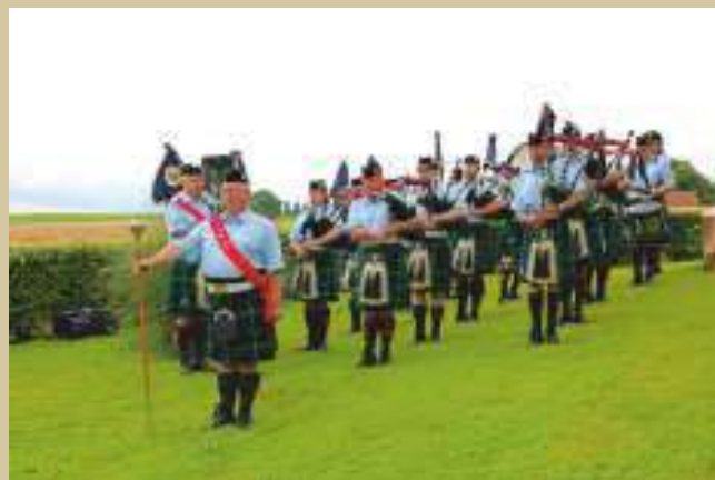
The Pipe Band at the Cairn site with No Man's Land behind them (the ground that the 15 th and 16 th RS crossed)

The 100 th anniversary event was one of only six authorised events sanctioned by the French Government; Contalmaison and the 16 th Battalion Cairn being designated as the "Cairn Ecosais." As in previous years the Royal Scots Association Standard Bearer Party paraded, with the "Blue Blanket" (a one-time Association banner now held in the City of Edinburgh Council offices) making an appearance. Additionally the Royal Scots Association Pipe Band played wonderfully while on parade at the Cairn. The Trust is hugely appreciative of the relationship with the Royal Scots Association and will work with them to further develop this important and critical link.