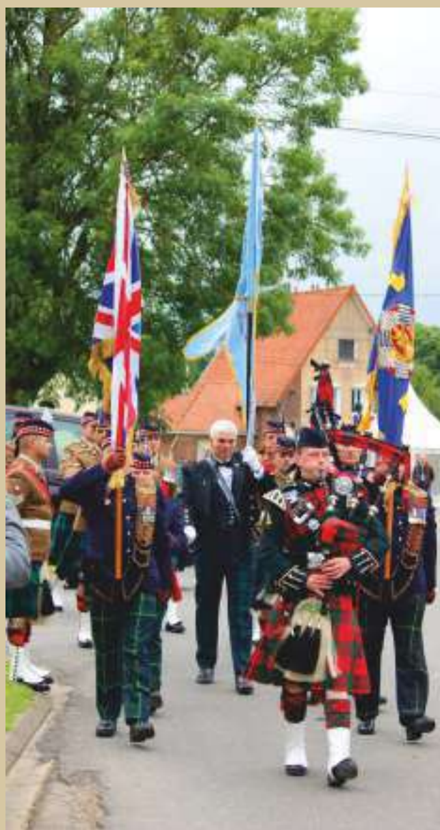
Led by the 2 SCOTS piper the Standard Bearers march on at 0918hrs in Contalmaison