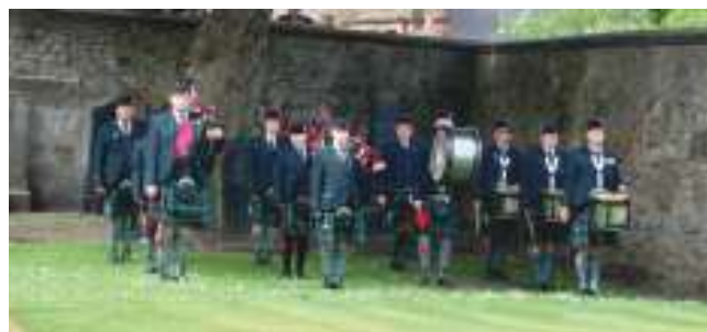
The Association Pipe Band on parade at Rosebank Cemetery