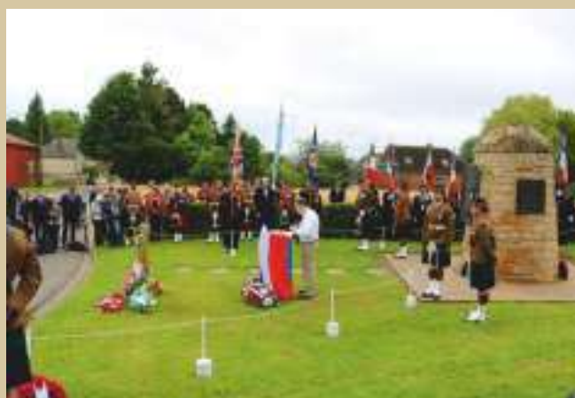
Contalmaison Cairn 1st July 2016