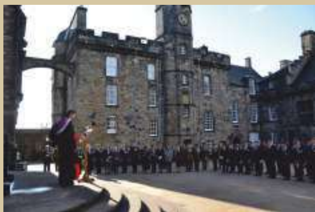
Dawn Service 1 st June 2016