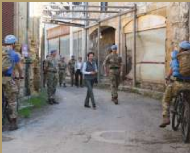
HRH visits a 1SCOTS patrol