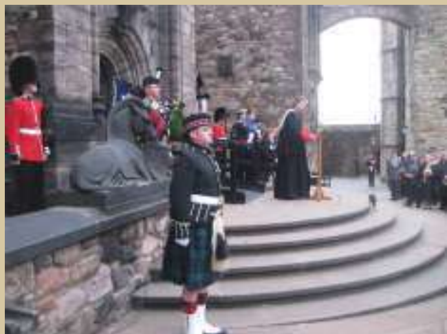
Evening Service 30 th June