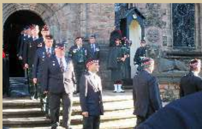
0730 on 1 st June 2016 Leaving the Shrine