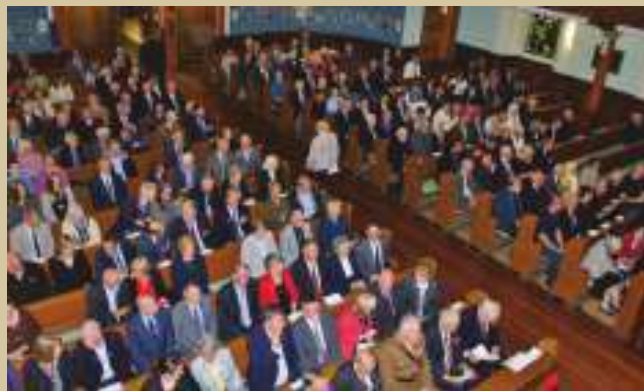
St Cuthbert's Service

Organised by the 16 th Battalion Trust, a service was held in St Cuthbert's Church, Edinburgh. The service was led by Service Ministers and Ministers from St Cuthbert's Church. The Church was well filled with few seats left vacant. While not organised by the Regiment, there was a good turnout of Royals for this Commemoration.