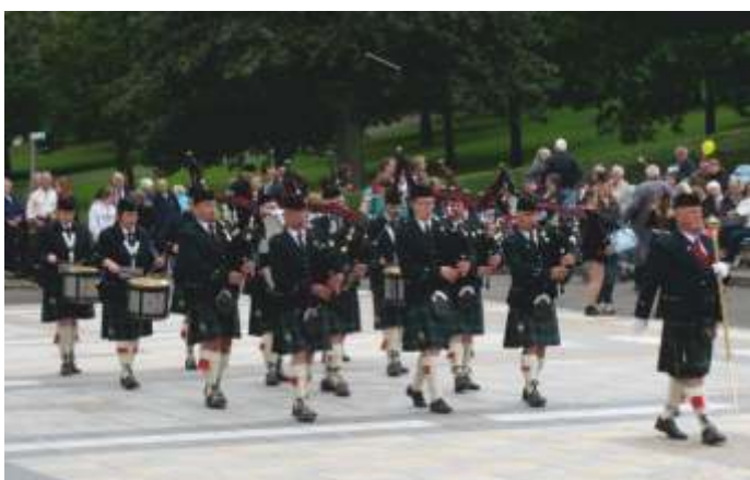
Pipe Band at Ross Bandstand