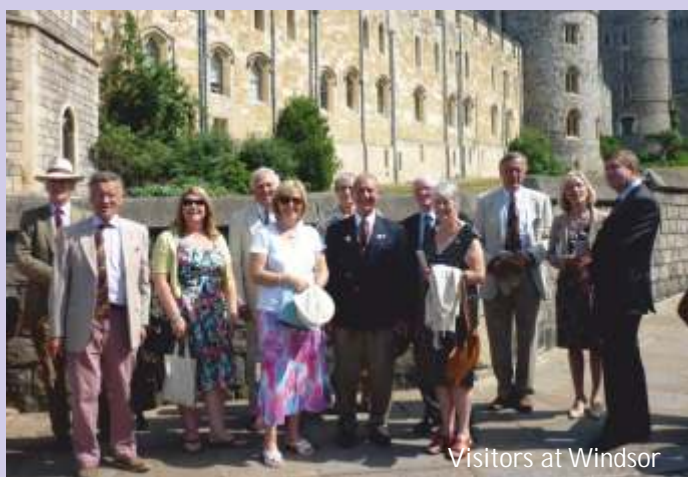
Visitors at Windsor

In addition to being present at Rosebank Cemetery the Association Pipe Band played alongside the 1 SCOTS bands at their homecoming parade in Edinburgh on 20 April. In late May it played at the opening ceremony of The US Childrens' Golf Tournament at Gosforth House, Aberlady, which was attended by over 800 youngsters and their parents from all over the world. More recently it played at The Royal Highland Show at Ingliston, the Armed Forces Day parade in Edinburgh and at the visit of HRH The Princess Royal to the RS Club on 4 July.