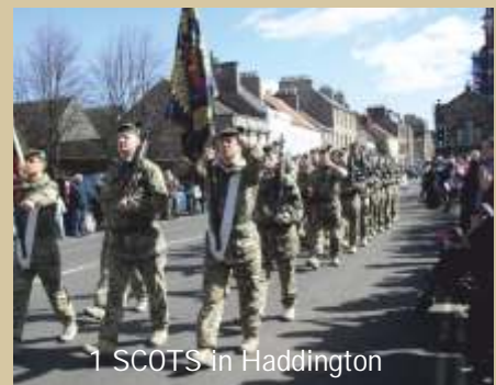
1 SCOTS in Haddington