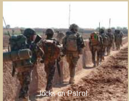
Jocks on Patrol