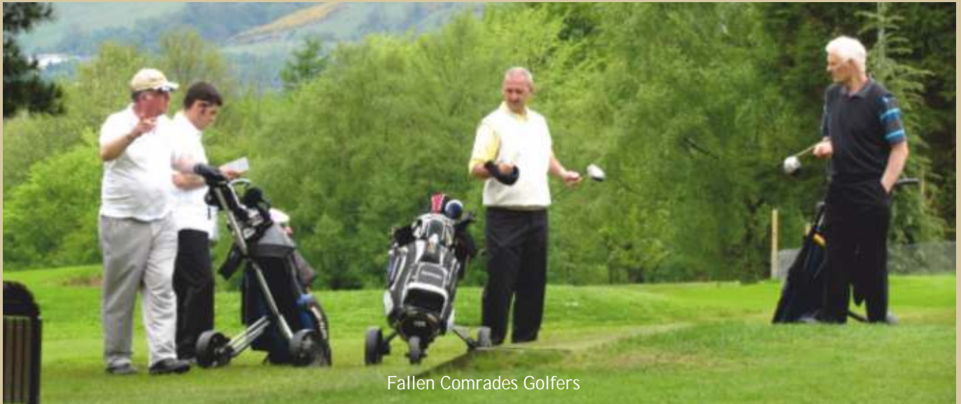
Fallen Comrades Golfers