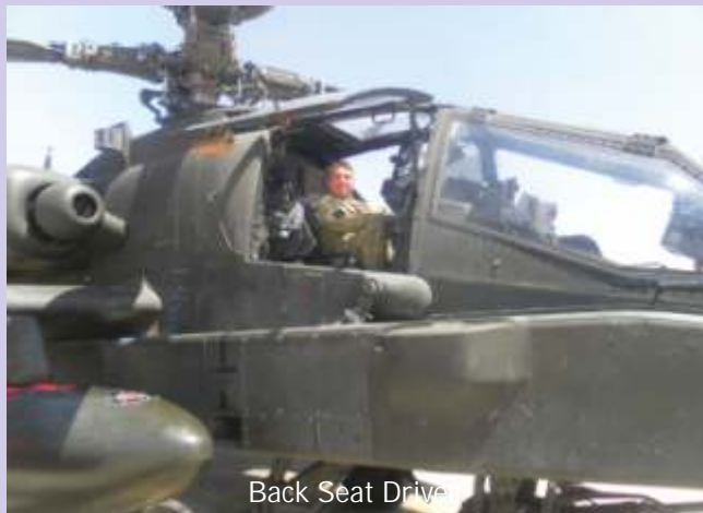
Back Seat Drive