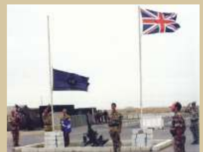
Lowering the Regimental Flag

Armed Forces Day started early in East Lothian with celebrations starting in Haddington on 24 June which were followed by tea and coffee in the Town Hall. Unsurprisingly, the Royals were not caught out by the early start.