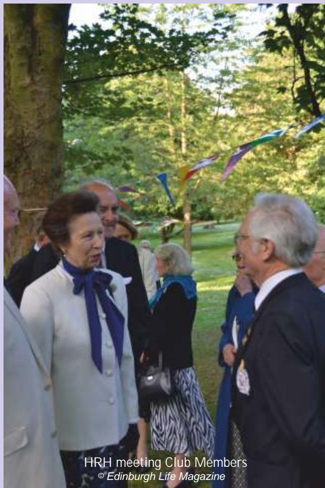
HRH meeting Club Members

HRH The Princess Royal attended a Reception and Beating of Retreat by the Association Pipe Band in Queen Street Gardens on 4 July to mark the Club's 90th Anniversary celebrations. It was a cool evening for July but it remained dry. The Princess spent an hour talking to those present before taking the salute after an excellent performance by the Association Pipe Band. After the Princess had left members returned to the Club for dinner and entertainment.