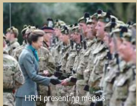
HRH presenting medals