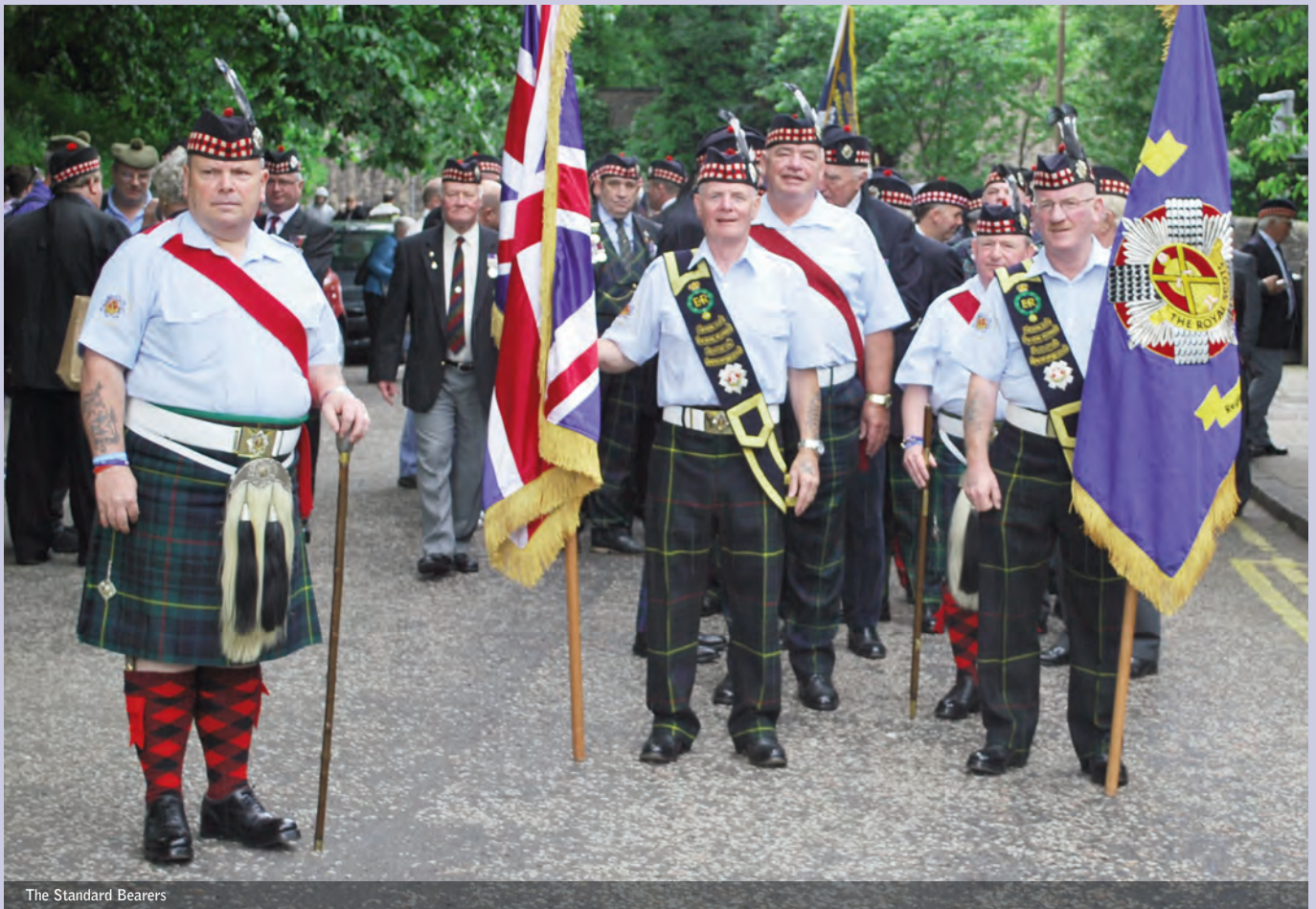
The Standard Bearers