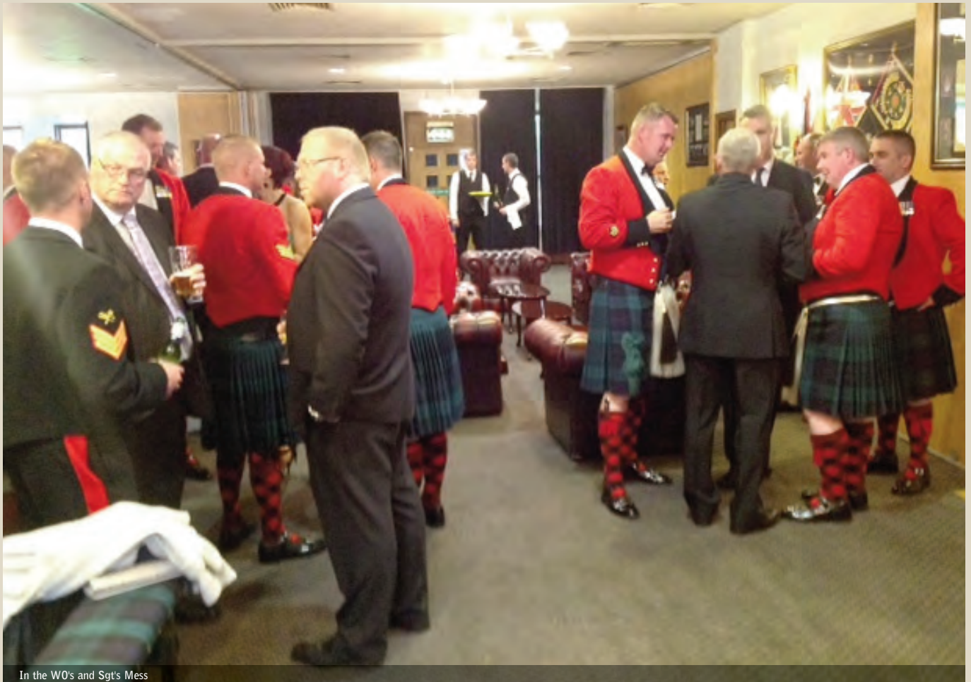
In the WO's and Sgt's Mess

What pleased us most of all was the opportunity to demonstrate support to our successors as they prepare for another demanding operational tour of duty. Best wishes to you all!