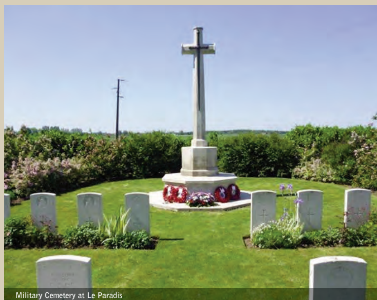
Military Cemetery at Le Paradis