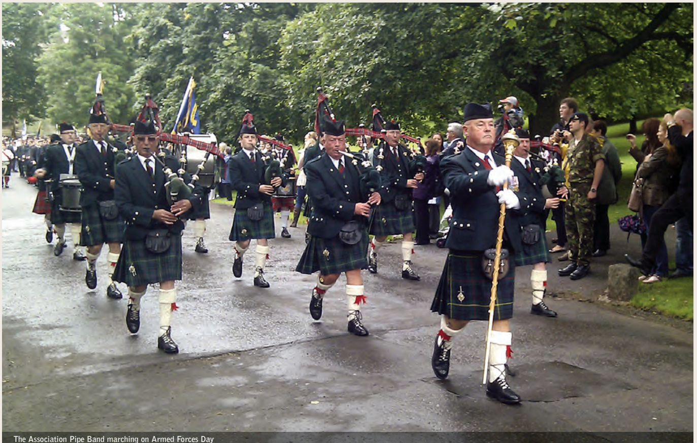
The Association Pipe Band marching on Armed Forces Day

To avoid mistakes, and unnecessary cost, the draft of individual plaques must be cleared with HHQ before being ordered. Plaques may only be made by the firm Alex Kirkwood & Son, 13 Albany Street, Edinburgh EH1 3PY. Tel: 0131 556 4779. Fax: 0131 556 4779. Email: sales@alexkirkwood.co.uk As at April 2012 plaques were approximately £25.00 each, including four small silver screws. Once made the plaque is to be passed to HHQ who will arrange for it to be displayed.