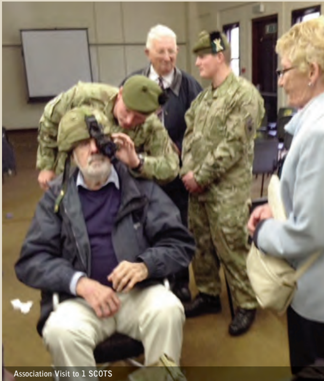
Association Visit to 1 SCOTS

and not at all fazed by being confronted by an audience of grizzled old veterans. Full marks lads and