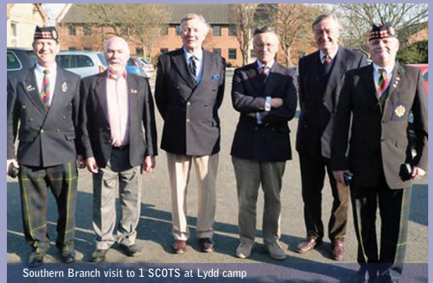
Southern Branch visit to 1 SCOTS at Lydd camp

Following an excellent briefing by the Commanding Officer, Lt Col Ben Wrench, the visitors viewed a simulated attack on a patrol base with the defenders responding with a variety of small-arms weapons. The final stand covered complex training for route clearance and compound entry. The visitors were much impressed by the enthusiasm and professionalism of both commanders and soldiers.