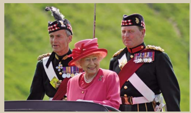
HM The Queen inspects the parade

1 RS Colours are marched off in slow time