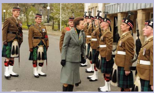
HRH Inspecting the Quarterguard

During the first part of the year 1 SCOTS enjoyed welcome respite after the rigours of operations during 2010. Nevertheless, it was not a period of