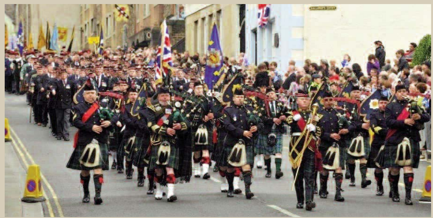
The RS Association Pipe Band