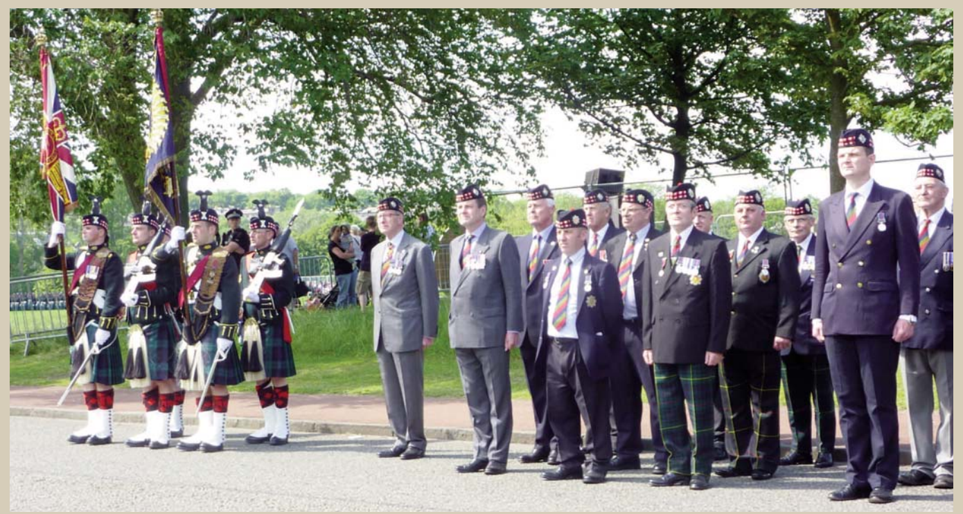
1 RS Colours and RS Association await the order to march on