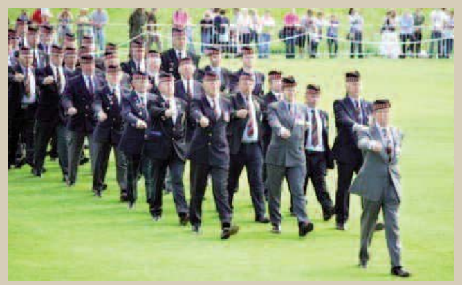
1 RS Colours and the RS Association march onto the parade ground