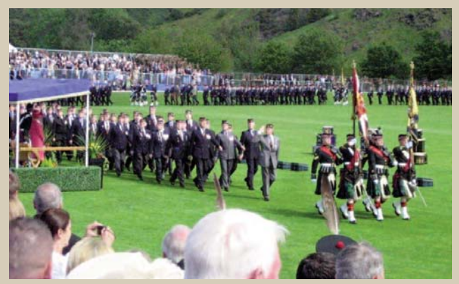
First of Foot, Right of the Line, Pontius Pilate's Bodyguard