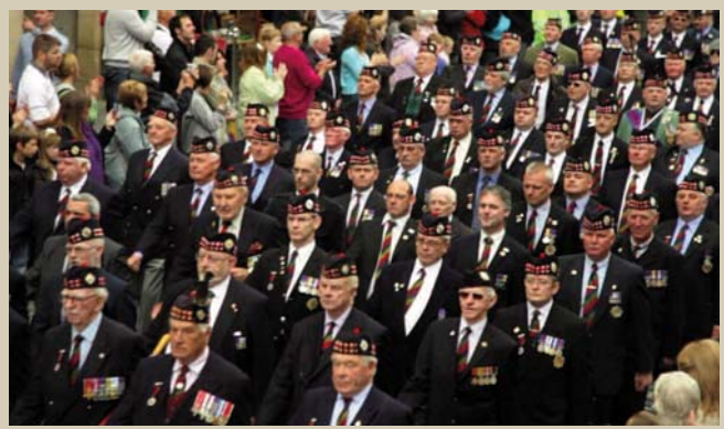
A Fine Body of Men