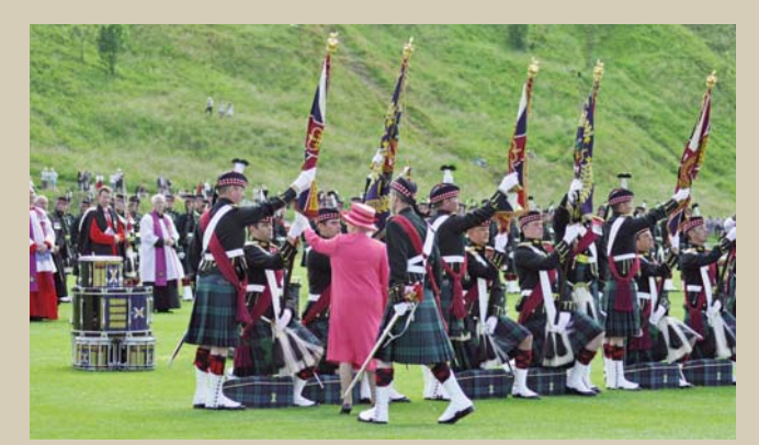
HM The Queen presents 1 SCOTS Colours