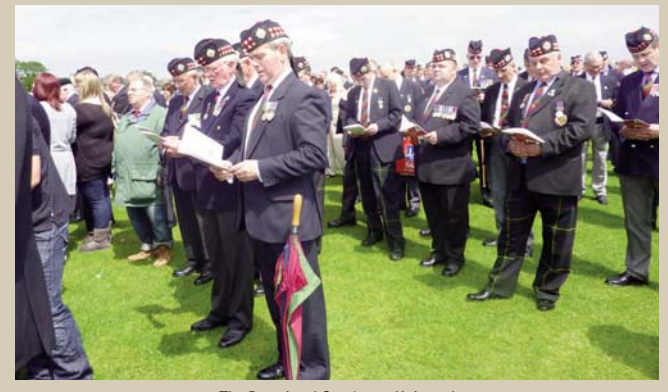
The Drumhead Service at Holyrood