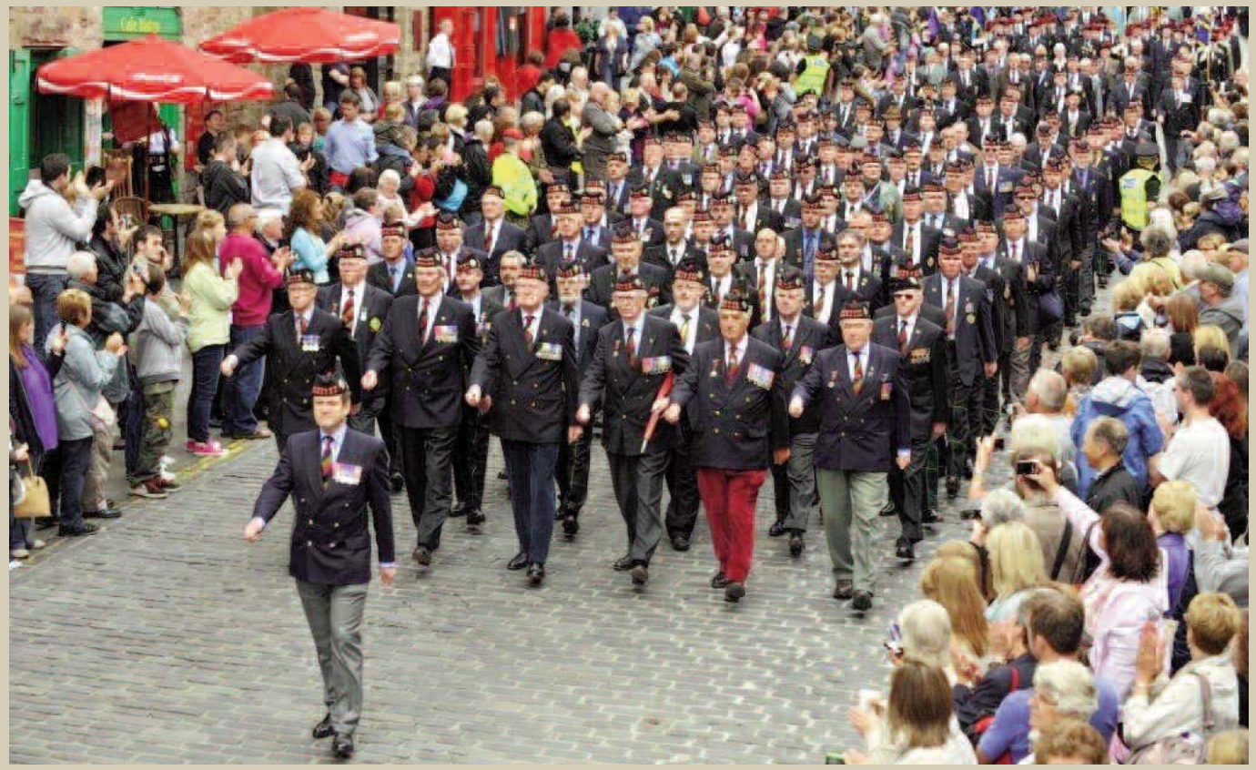
The RS Association Marching Down the Royal Mile