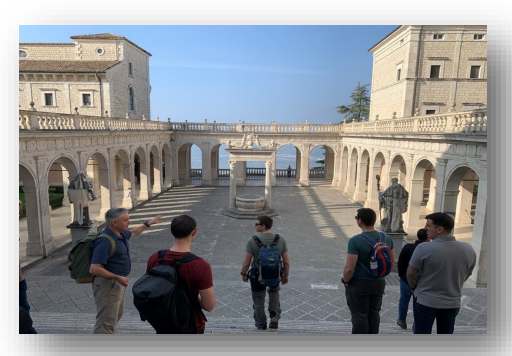
At the Monastery on top of Monte Cassino

In November last year thirteen 1 SCOTS individuals, accompanied by two of their US counterparts, deployed on Ex JUINS JOCKS to Monte Cassino in Italy on a battle-field study. They considered the Italian Campaign of World War II, in particular they followed in the footsteps of Gen Alphonse Juin's French Expeditionary Corps as he led a partnered force of North Africans in an outflanking manoeuvre over the mountains around Monte Cassino, which ultimately unhinged the German positions dominating the Liri Valley. The team looked at the difficulties Gen Juin faced in using a partnered force in a warfighting role and the techniques and tactics he used to best employ them.