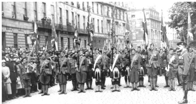
The official opening of The Royal Scots Club, Abercrombie Place, Edinburgh on August 10 th 1922, by Her Royal Highness Princess Mary, the Colonel in Chief of the Regiment. The current Colonel in Chief is HRH Princess Anne. www.royalscotclub.com .

'Mandalay' p100, The Thistle 1927 2 nd New Series Vol II /3.