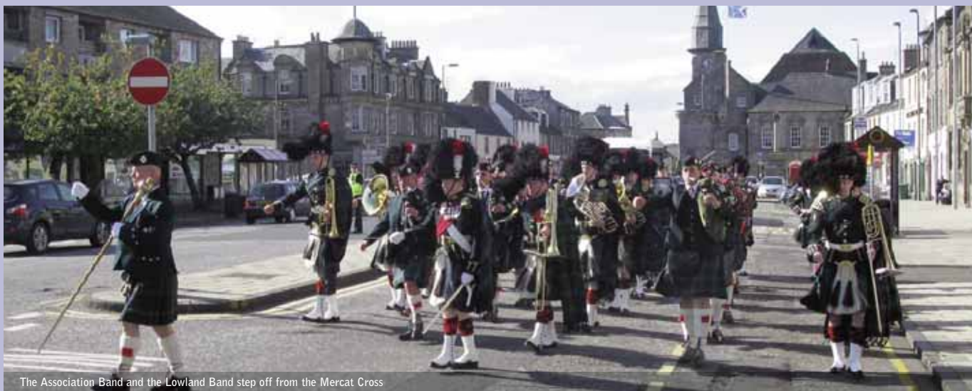
The Association Band and the Lowland Band step off from the Mercat Cross