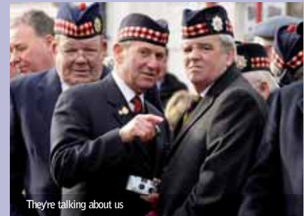
They're talking about us