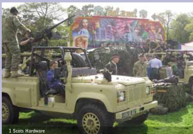
1 Scots Hardware