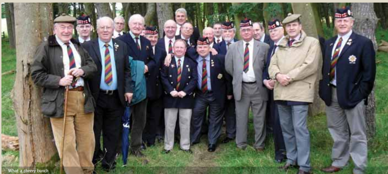
What a cheery bunch

A representative party of 1 SCOTS attended the St Andrews Night dinner in the RS Club.