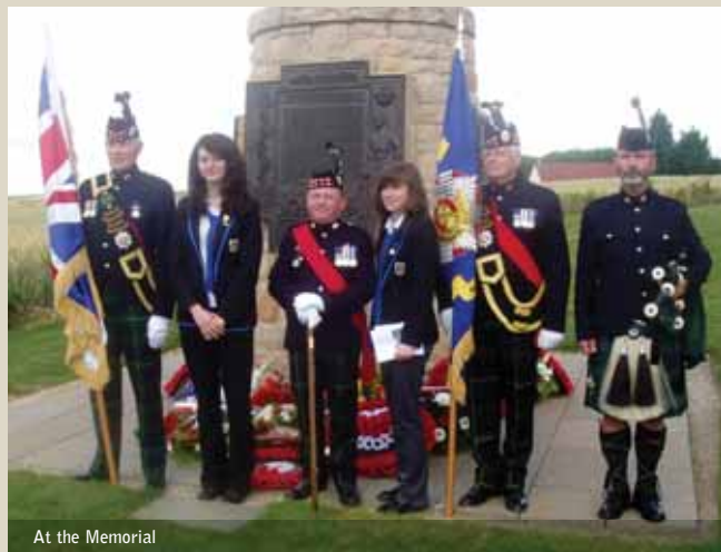
At the Memorial

A combined party of the RS Association and the McCrae's Battalion Trust commemorated 16 RS and