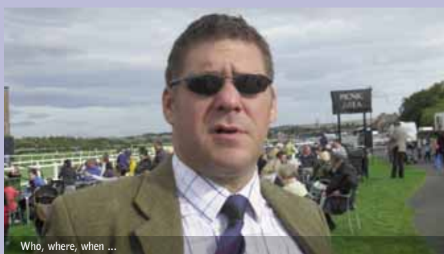
Who, where, when ...