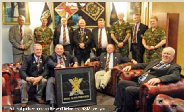
Put that picture back on the wall before the RSM sees you!