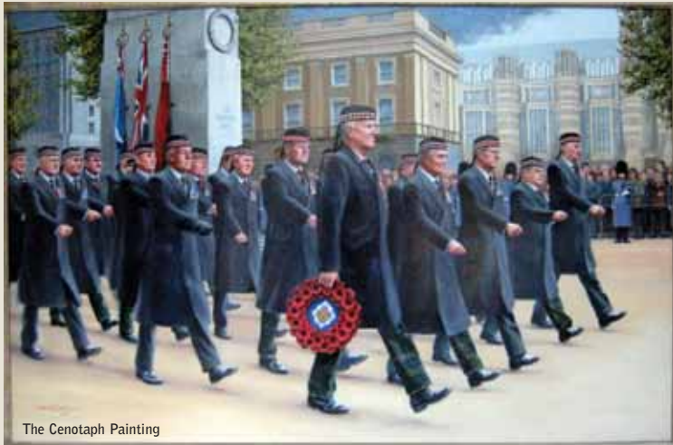
The Cenotaph Painting