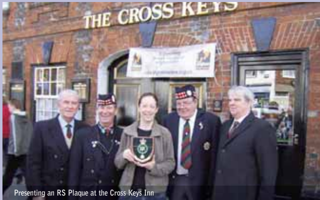
Presenting an RS Plaque at the Cross Keys Inn

Royal Wootton Bassett has featured regularly in the Southern Branch programme. On the initiative