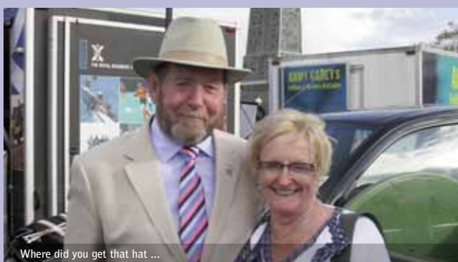
Where did you get that hat ...