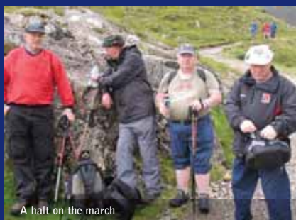
A halt on the march

Annually the RS Benevolent Fund disburses up to forty thousand pounds to Old Royals and their dependents in need. Thus there is always a need for funds. Five members of the Association, from the NI Branch supported by the East of Scotland and Edinburgh Branches tackled the West Highland Way in August to help. The walk was completed with record-shattering statistics. More than 100 miles covered over six days in