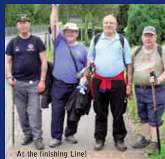
At the finishing Line!