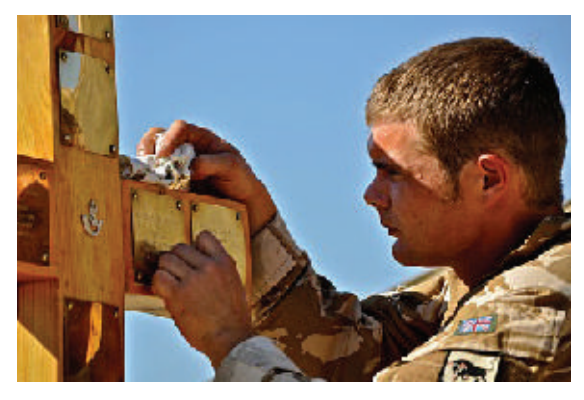
The Wishtan Cross

We picked up their baton in September. Although our approach has been similar, tactical developments have allowed us to target the IED threat with more success. We are wary of tempting fate, and our unofficial mottoes have become 'a day at a time' and 'you are only as good as your next patrol'. The daily reminder to do our duty is the cross bearing the names of those who have fallen here before. Our path has, as you would expect, not been easy. We have had our own wounds to see to. But we have also had success. Our success may seem gradual but the significance of successfully encouraging locals to use roads and compounds they previously have not, whether due to IEDs or a misplaced fear of soldiers, cannot be underestimated.