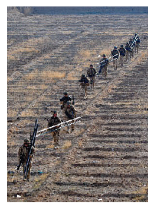
Patrolling around Wishtan

Most of the Afghans who remain in Wishtan's high walled compounds, are wonderfully hospitable and show real understanding for the campaign that is being fought around them. We speak to the victims of the insurgency – the fathers whose children have been killed by IEDs while playing in the street and the already impoverished who have their money and supplies stolen from them.