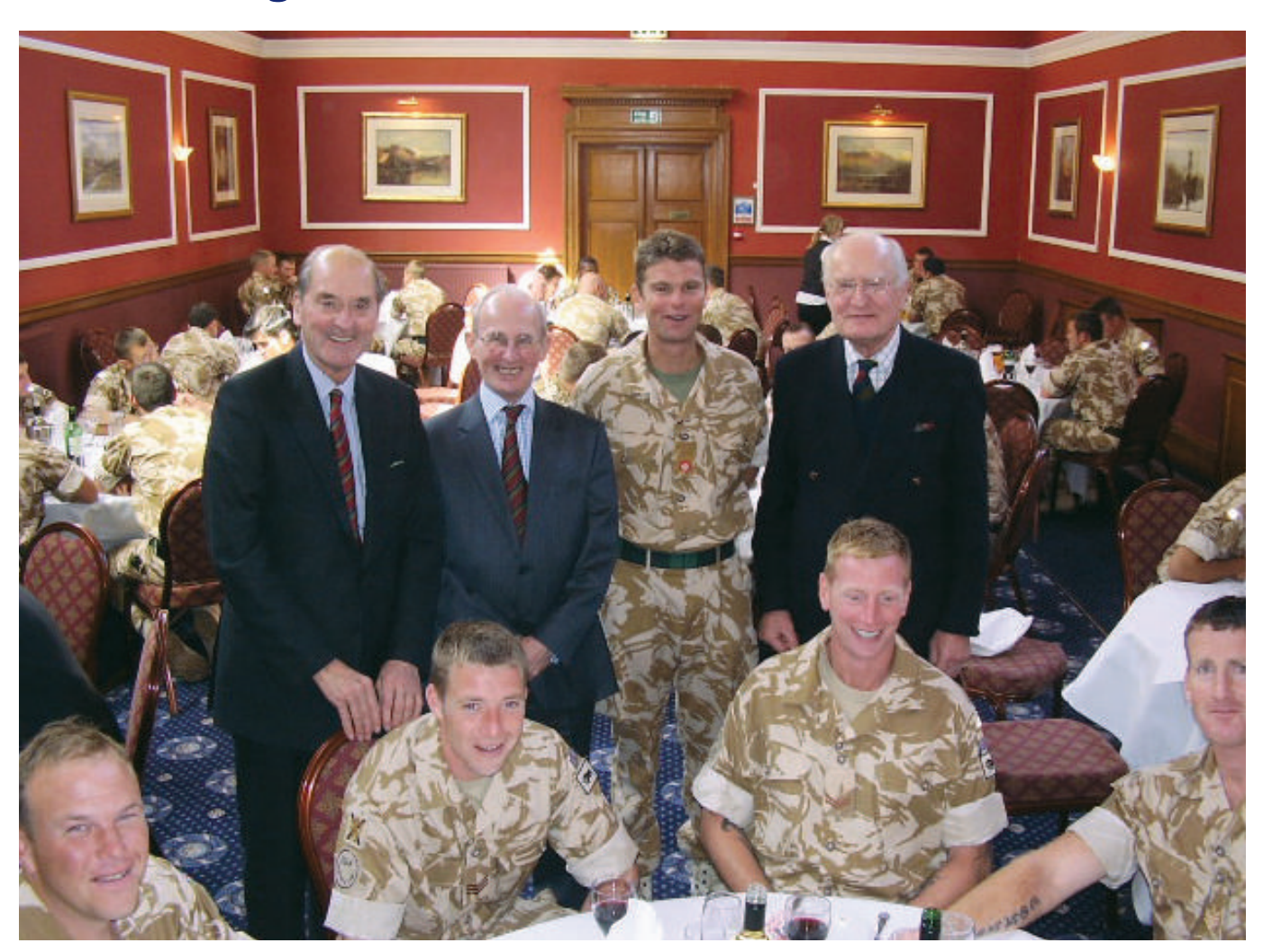
B Coy at the Royal Scots Club

The redevelopment of the basement areas and the installation of the lift continue here at The Royal Scots Club, and we now have a completion date of the end of September 2010.